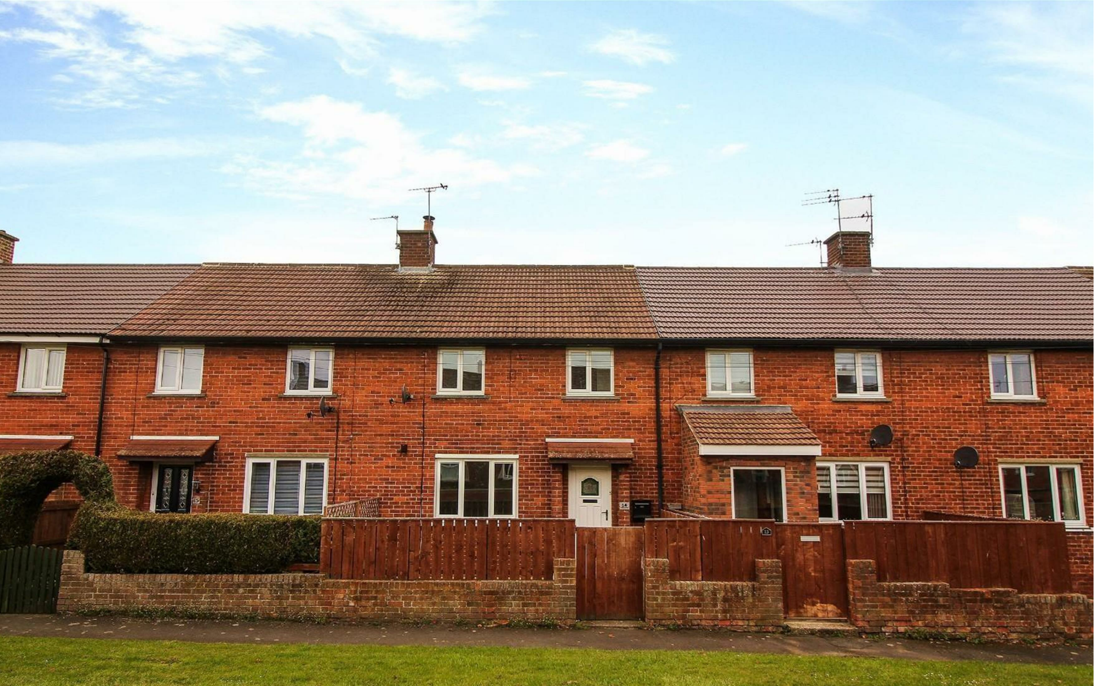
Fontburn Gardens, Morpeth NE61 2JR